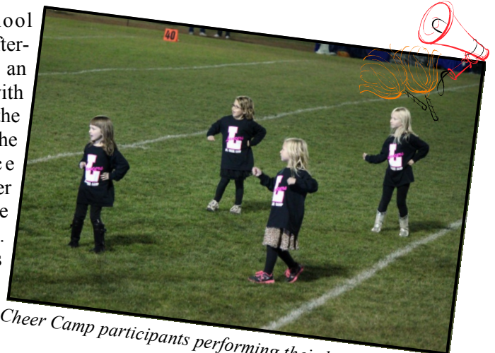
Cheer Camp participants performing their halftime routine.

The Liberty High School cheerleaders provided an after-school activity to promote an interest in cheerleading with elementary students during the week of October 14. The culminating experience provided some actual cheer activity at halftime of the home football game vs. Colfax. All participants received a cheer t-shirt and a chance to perform a dance routine and several cheers in front of the hometown crowd.